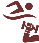
Swimming Pool and SPA, Gym