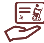
People Identification In Leisure Center