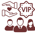
Loyalty, VIP Program and Customers